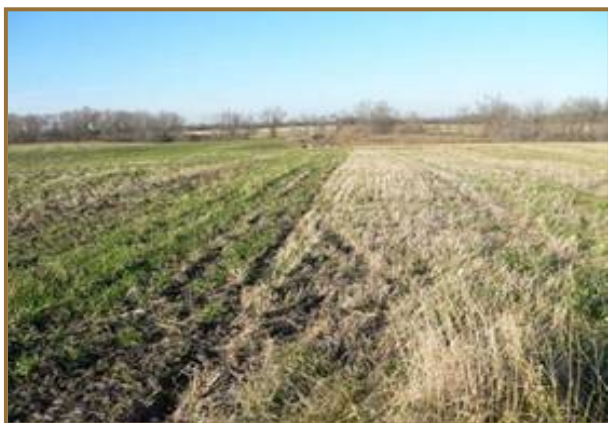
Figure 2. Conventionally-tilled field on the left, conservation-tilled field on the right

The term conservation tillage can be applied to practices ranging from minimum tillage to zero tillage—as is the case in the STC economic analysis. In the STC biophysical (twin watershed) study, conservation tillage refers to a field treatment that approached zero tillage. It received no heavy duty tillage in the fall, yet soil disturbance sometimes occurred prior to spring seeding when ammonia fertilizer was injected in a separate field operation, or when harrowing was used to break up the straw cover.