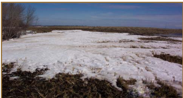
Figure 4: Conservation tillage may not reduce the export of dissolved P in snowmelt runoff.

These findings suggest that the increase in total P is due to an increase in dissolved P released from crop residues during freeze-thaw events, and/or from soil P that accumulates in surface soils because it has not been mixed during tillage. Results demonstrate that although conservation tillage can effectively reduce sediment and sediment-bound nutrient export from agricultural fields, it can increase the export of dissolved P occurring during snowmelt runoff. In these situations, it may be appropriate to implement additional management practices (such as intermittent tillage) to reduce the accumulation of P at or near the soil surface. These findings could apply to much of the cold, semi-arid landscape of the Canadian Prairies (Figure 4) and may be relevant wherever snowmelt runoff dominates and dissolved P is the major form of P in runoff.