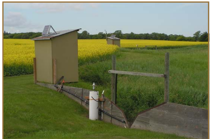
Figure 1. Conservation tillage study site in south-central Manitoba

WEBS studies are conducted at nine watershed sites across Canada. These outdoor living laboratories bring together a wide range of experts from various government, academic, watershed and producer groups. Many valuable findings have emerged and research continues at all sites.