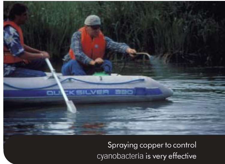
Spraying copper to control cyanobacteria is very effective

Some species of cyanobacteria produce liver or nerve