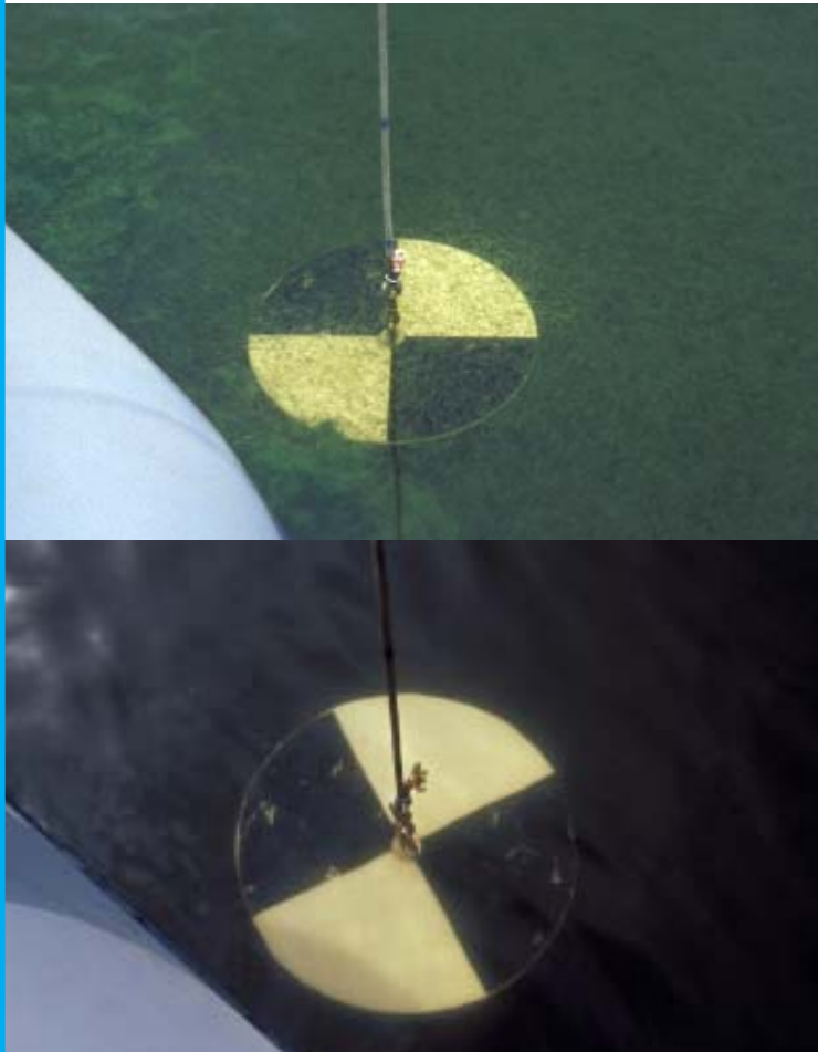
A secchi disk showing dugout water before and after a successful treatment of one type of cyanobacteria

Well-designed, continuous, year-round diffused aeration at the bottom of the dugout can minimize the natural recycling of phosphorus from the sediment. Other methods such as remedial dugout coagulation treatment will remove phosphorus from the water column, and can minimize the potential growth of cyanobacteria.