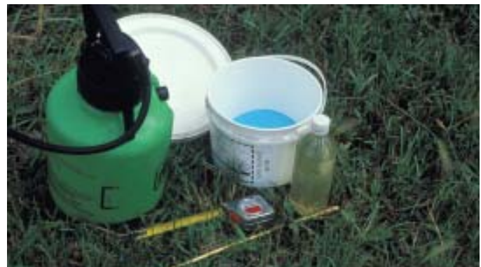
A 10 L hand pump spray applicator is ideal for small dugouts

Best Management Practices (BMPs), such as grassed buffers and fencing to exclude animals (including livestock) from water, can minimize external phosphorus inputs from soil, fertilizer, and animal manure. Perimeter dyking around the dugout combined with an inlet control structure can be used to divert silt-laden or nutrient-rich runoff water away from the dugout.