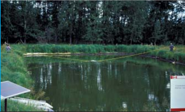
Two people drag a sock of copper back and forth over the entire surface area