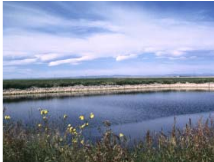
Dugouts are an important water source on the Prairies. It is necessary to maintain the best water quality possible

Continuous year round aeration through diffusion can offset these problems.